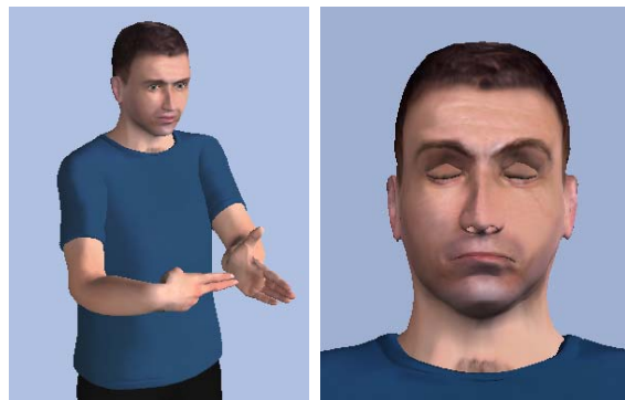
Figure 2. Example of VGuido animation

The gestures are represented by means of VGuido (the eSIGN 3D avatar) animations. An avatar animation consists of a temporal sequence of frames, each of which defines a static posture of the avatar at the appropriate moment. Each of these postures in turn can be defined by specifying the configuration of the avatar’s skeleton, together possibly with some morphs which define additional distortions to be applied to the avatar (Figure 2).