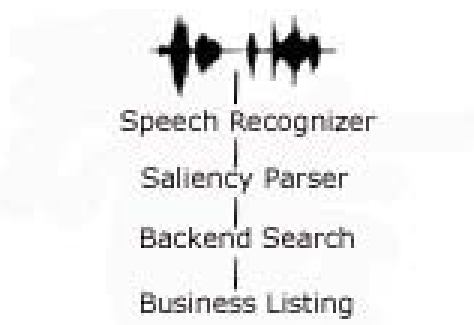
Figure 1: An overview of the directory-assistance system showing the role of the saliency parser.

the number of matches that can be presented as well as the number of interactions between a caller and the system.